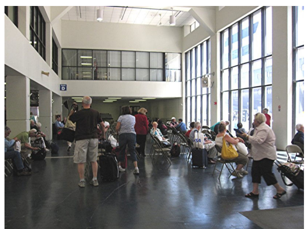
minute line of people we were checked in at the counters shown on the right.

We Start the Cruise: We hustled back to the hotel and after retrieving our luggage took a taxi on the short ride to the Maasdam. Porters took our bags and we were ushered into